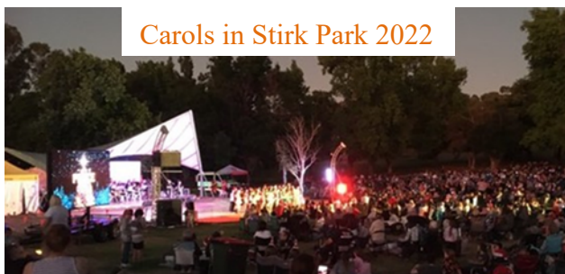
Carols in Stirk Park 2022