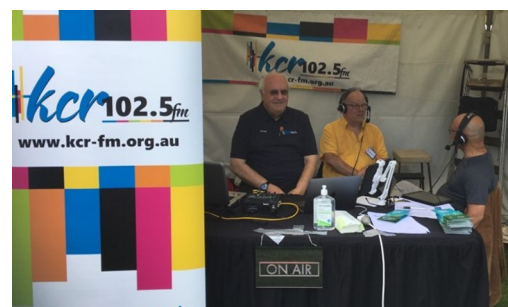
Have-a-Go Day 2022